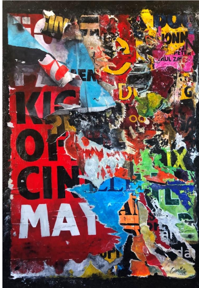
Figura 2 - Sovrapposizione II, Miguel Àngel Craviotto (2021)

With Craviotto, the effect of the illusion of torn posters or newspapers can be seen even better in the work "Sovrapposizione II", in mixed media on paper.