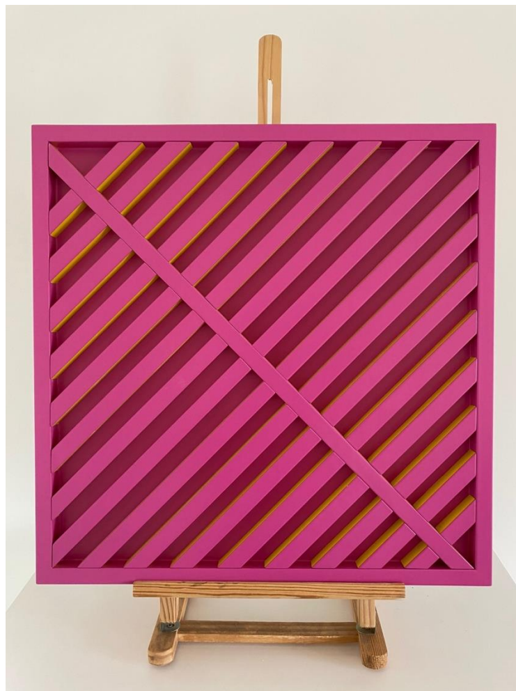
Image image2 - Kinetic / Pink Barbie in a Yellow Cab, Tom Vanhauwaert, 50x50 cm

“My lifeline is hidden in my artwork: to look at life in a different way.” 2